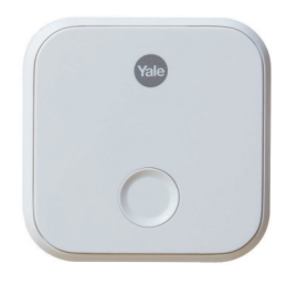
Yale Connect Wi-Fi Bridge